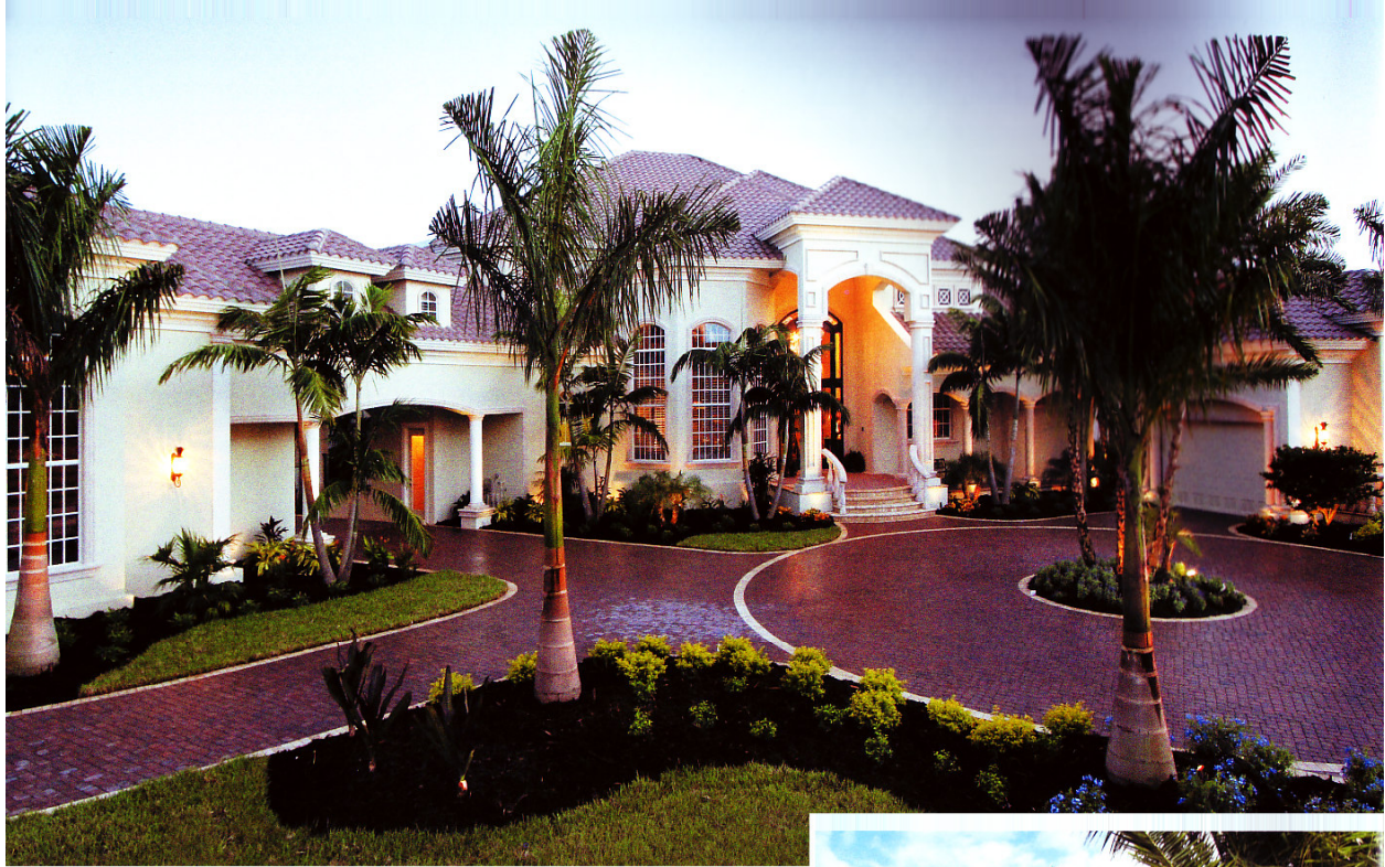
Various roof lines and levels create visual interest on the front exterior.