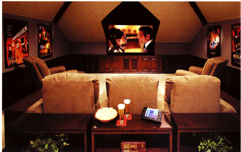
Dark bookshelves and wainscoting wrap around the media room for a rich, warm feel.

and finished in a "cognac" tone. The table is so long that there are two chandeliers above it for illumination. Dining chairs match the table except for the host and hostess chairs which are in a floral print for accent. The nearby kitchen is a gourmet's delight. A six-burner gas stove, two dishwashers, two convection ovens, and a warming oven are but a few of the features which make this a cook's paradise. The custom-made cabinetry features a finish called "burnt sienna" with "tropic brown" granite countertops. To avoid monotony in a space this large, the island was finished in a much darker tone with a black glaze. The cabinetry is accented with corbels and decorative touches. An unusual feature is where a portion of the cabinetry is suspended above