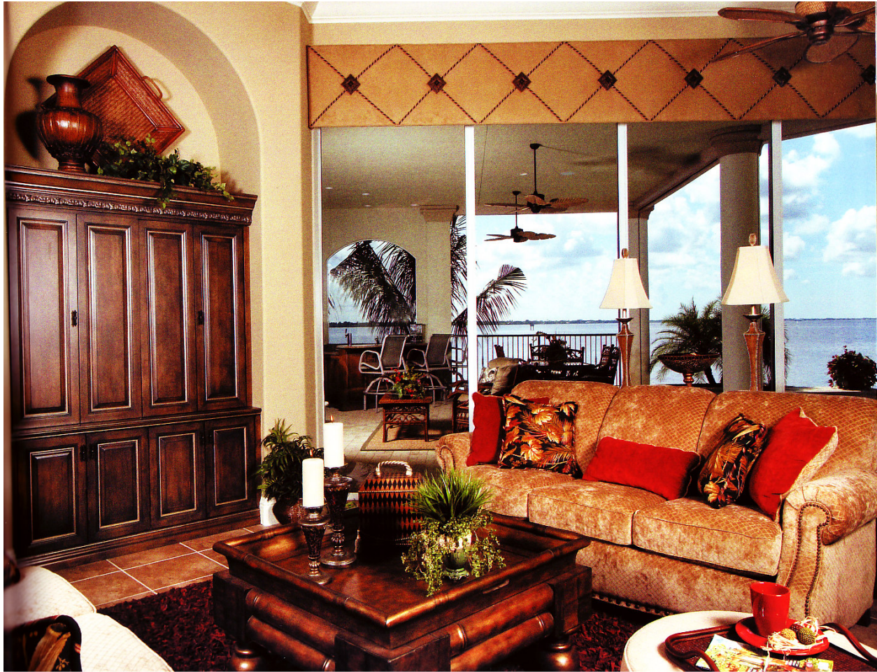
The family room faces a garden to one side and the water to the other. Sliding glass doors pocket away to integrate the outdoors with the inside.

the countertop, leaving space for a window underneath. This lets in sunlight as well as allowing those inside to see outside to the private garden. Entertainment was a major factor in the design of this home. There is what is called the "cigar bar and media room" on the second level and, on the opposite wing, also on the second level, a separate game room with wet bar, refrigerator, dishwasher, and microwave. The cigar bar is very masculine in feel with a martini bar, roulette table, chess board, and a separate outdoor space for smoking. Adjacent is the media room which, again, is masculine in feel. Reclining theater seats are plush and more man-sized for comfort. Lower-level bookshelves wrap around the seating area while dark-toned wainscoting wraps around the walls of the room. For an airier setting, there is the family room with views