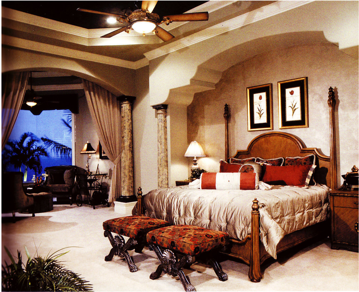
The master bedroom is elegant and luxurious. A columned archway with sheer drapery treatment lends a sense of privacy to the sitting area.

the master bedroom is a bit more formal than the rest of the home, but the idea was to create an extremely luxurious, elegant retreat for the man and lady of the house. Not satisfied with simply elegant or luxurious, the builder included a safe room in the master closet. There is the regular walk-in closet, then passage through a fire-rated steel door with a deadbolt. The floor, ceiling, and walls of the 12-foot by 12-foot room are solid concrete. In the event of a power outage, there is ventilation and a heavy-duty, oversized generator to take care of energy needs. One can feel very comfortable in the event of, say, a hurricane. The spacious master bathroom features