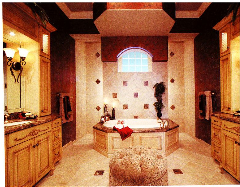
The dropped soffit in ceiling of the master bath mirrors the shape of the marble-topped