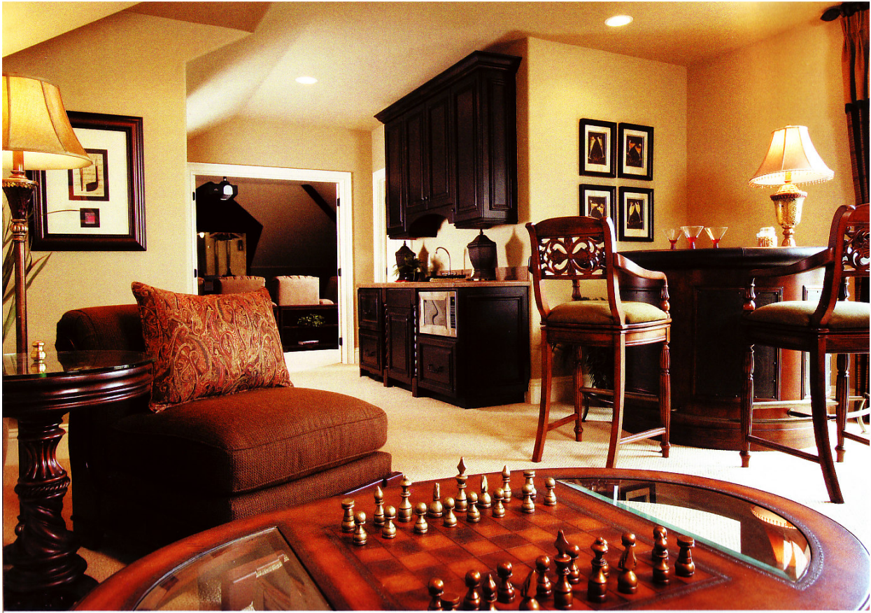
Hosting a more masculine feel, the cigar bar and media room include a martini bar, game table, chess board, and outdoor space for smoking.

and finished in a "cognac" tone. The table is so long that there are two chandeliers above it for illumination. Dining chairs match the table except for the host and hostess chairs which are in a floral print for accent. The nearby kitchen is a gourmet's delight. A six-burner gas stove, two dishwashers, two convection ovens, and a warming oven are but a few of the features which make this a cook's paradise. The custom-made cabinetry features a finish called "burnt sienna" with "tropic brown" granite countertops. To avoid monotony in a space this large, the island was finished in a much darker tone with a black glaze. The cabinetry is accented with corbels and decorative touches. An unusual feature is where a portion of the cabinetry is suspended above