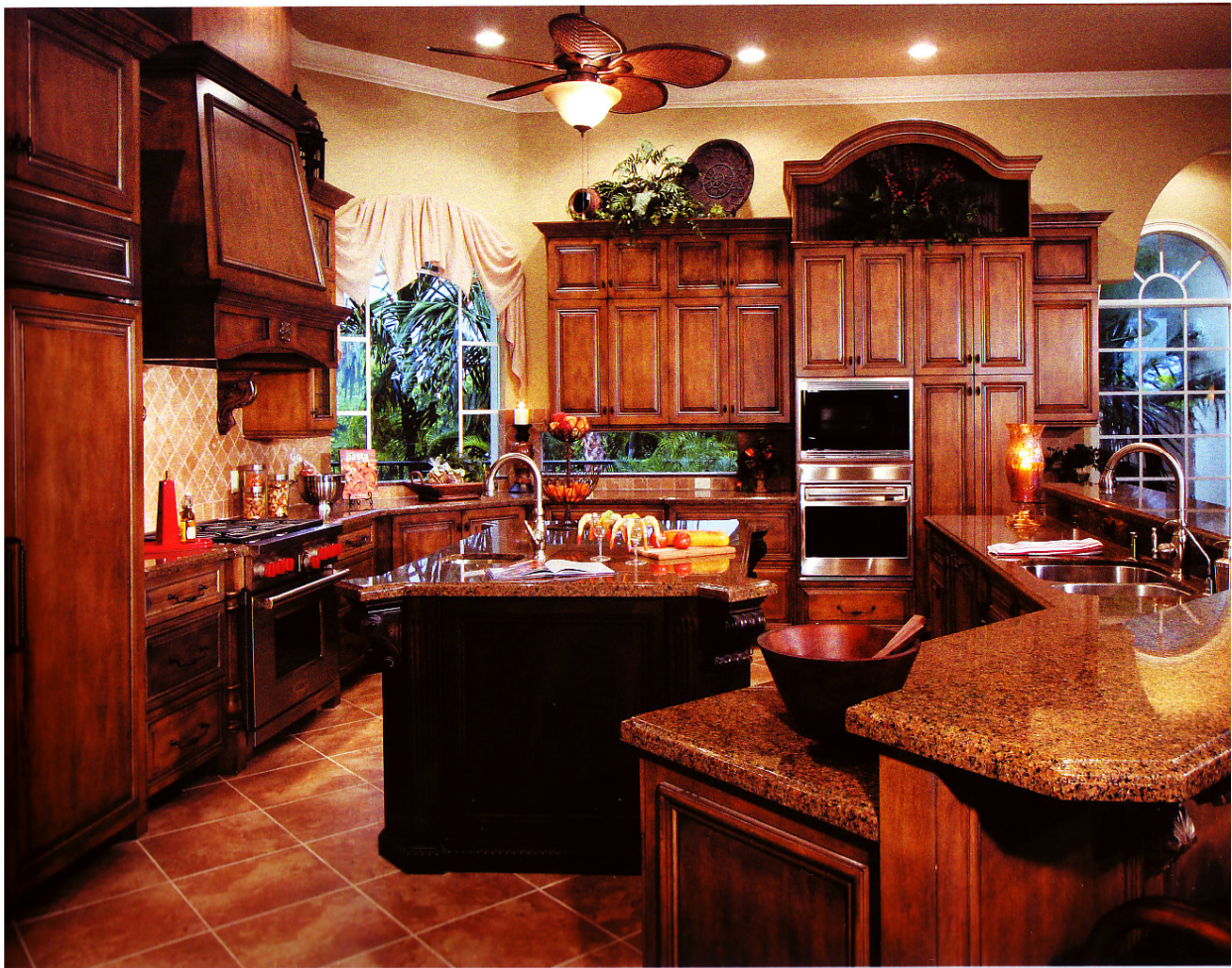
Extra light and views are brought into the kitchen by the window spanning underneath the section of cabinetry which seemingly hangs suspend

comfortable elegance. Flooring is two toned and set on a diagonal to create visual interest. Above, the two-story-high ceiling is a double-stepped tray, painted in the middle, which contains indirect lighting in each step. Seating includes an upholstered sofa in a khaki-colored chenille. Two smaller chaise longue ends make it an unusual, interesting piece. The glass-topped coffee table is quite large at six feet by six feet. It is completely bench made and hand carved in Italy. Across the room, the fabric on the outer back panel of the chair matches the chenille on the sofa while the bird-of-paradise print on the inside of the chair and ottoman matches the pillows on the sofa. This large, bird-of-paradise print is in a red, almost a garnet red, with black. The bird-of-paradise motif is seen again in the carving of the frame of the mirror above the sofa. Across the room, the fireplace features keystone in the mantel, columns, corbels, and arch detail. Porcelain tile was set on a diagonal above the fireplace as a relief to artwork there. Above that, on a