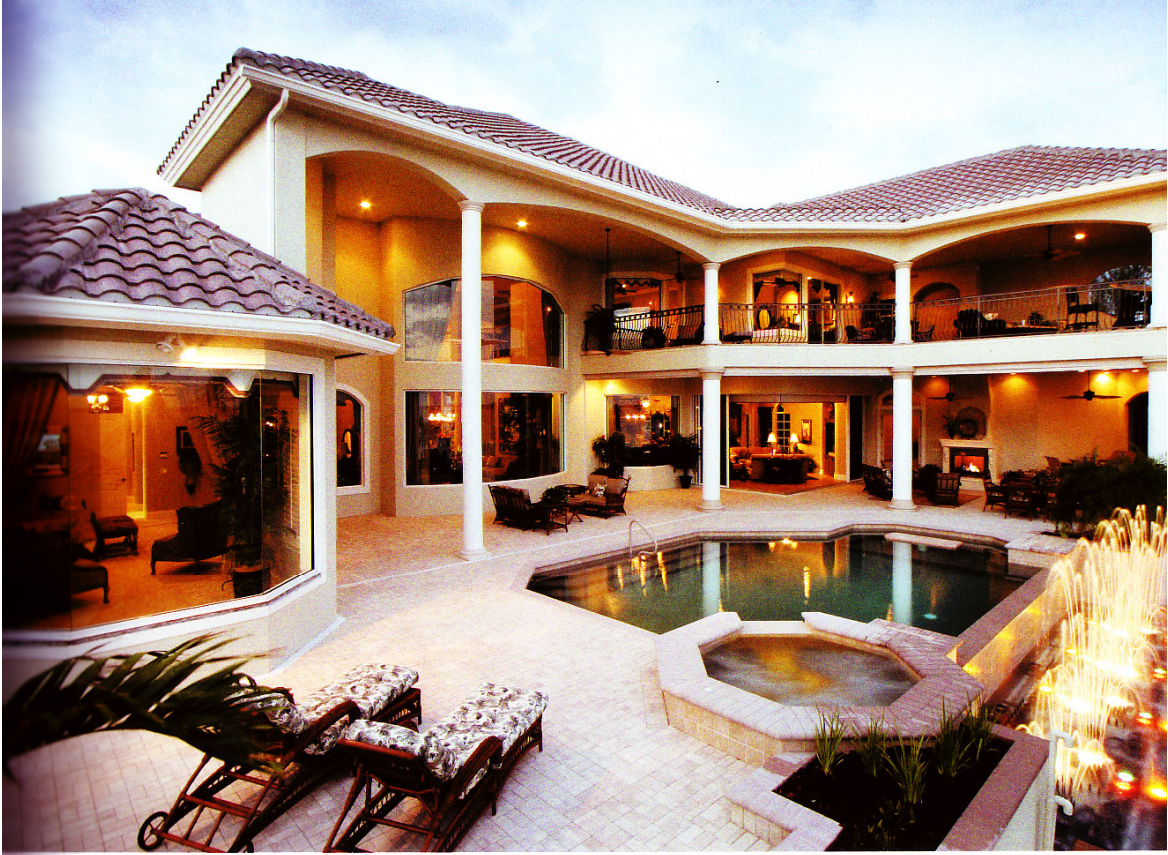
Above, outdoor living is enjoyed on the expansive lanai and deck. Below, the multi-colored fountain feature adds a wonderfully exciting dimensi