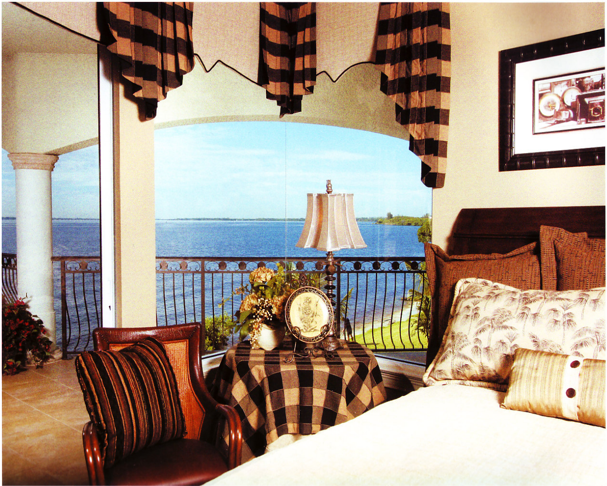
A mitered glass window overlooks the water in the upstairs guest retreat. Additionally, sliding glass doors lead to a large balcony.

Outside the glass doors to the left as one views the water is where the outdoor barbecue and wet bar area is located. There is a summer kitchen with granite countertops, a gas grill, refrigerator, dishwasher, and beer tap refrigerator. An electric screen enclosure comes down to protect this area from bugs, if necessary, but still allows the breezes and views to be enjoyed. There also is an outdoor fireplace with a keystone mantel and corbels to take off the chill during the winter months. Furniture is a weather-resistant vinyl which has a wicker-like appearance. At the opposite end of the house, but also overlooking the pool and patio deck is the master bedroom suite. It includes a separate sitting area which