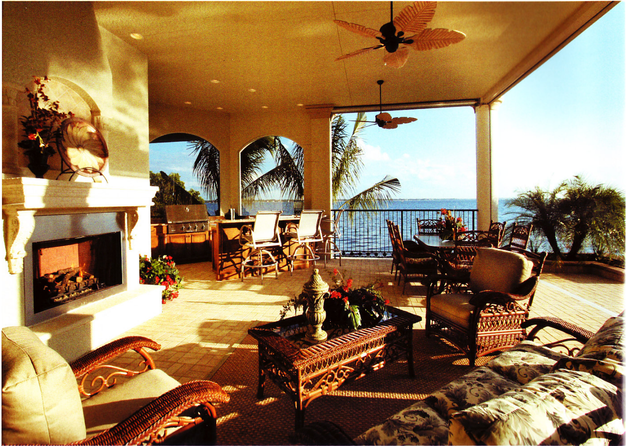
A fireplace takes the chill off the lanai in the winter time. The outdoor kitchen is complete with many appliances and granite-topped cabinetry

marble-topped vanities and tub surround with the same marble used as an accent on the floor and walls. The ceiling has a drop-down soffit which mirrors the shape of the tub below. The rainhead shower is a walk through, accessible from either side. A brick red wallpaper with taupe and black floral accents picks up the tones of the bedroom. The residence includes three guest bedrooms, a butler's pantry, a wine room with provisions for more than 100 bottles, a custom-finished elevator, and so many fun or entertaining or interesting features that we could not possibly mention them all here. The home was designed and decorated with the