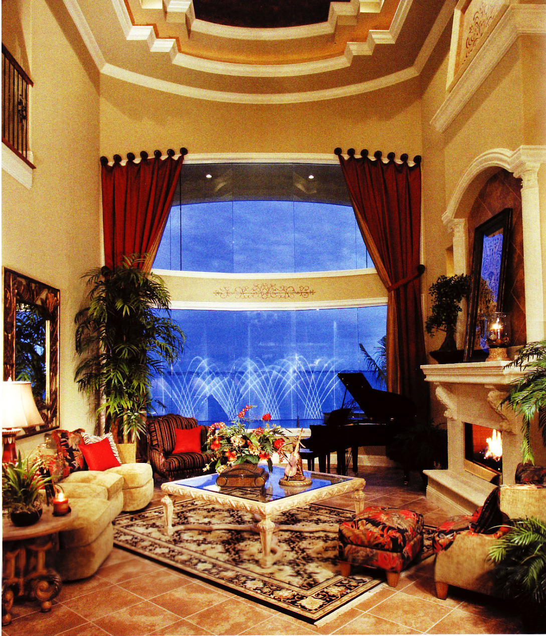
The waters of the negative-edge pool and the river give the illusion of coming right up to the bowed glass wall of the living room.

cochere is a three-car garage while to the right of the house is a small carriage garage. With the porte cochere leading to one garage and a colonnade leading from the other, the varied roof lines with different heights and levels began to create the aesthetics of the front of the home. Handsome touches such as keystone balustrade and window details enhance the rich feel of the exterior. An arched and columned, two-story-high entryway with custom-made, solid mahogany front doors establishes a grand sense of arrival. It is from here that one steps through the entry immediately to be enveloped in the awe-inspiring living room. One views across the room to a wall of two-story-high, bowed and mitered glass, through which the water of the disappearing, or negative, edge swimming pool seems to become one with the